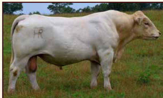
HBR Big Mack 983 P

REF B HBR AUTO PILOT 941 P 1/26/2011 M796443 POLLED