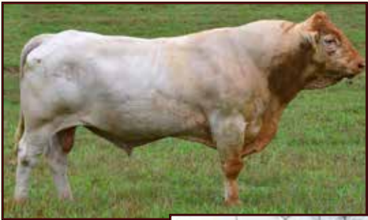
HBR Program 7041