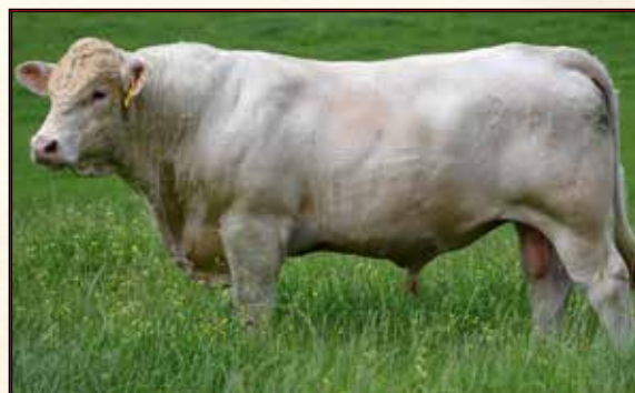
HBR Auto Pilot 941 P

REF C HBR HARLAN'S KEYSTONE 016 P 10/28/2010 M799031 POLLED