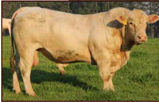
HBR Magnum 236 P