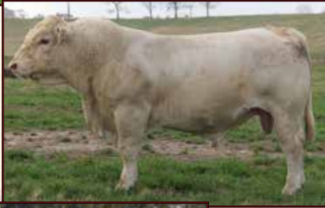
HBR Big Mack 223 P