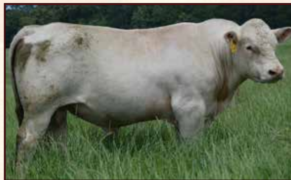
HBR Harlan's Keystone 016 P